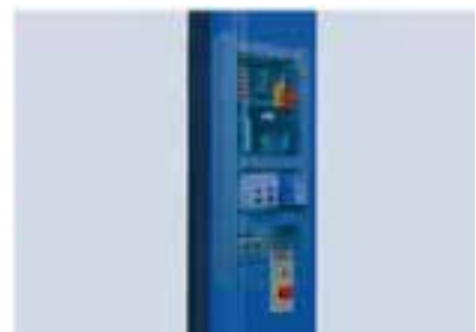
Safe control electrics