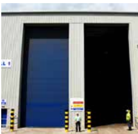
Atex Rated & Explosive proof (EX Rated)