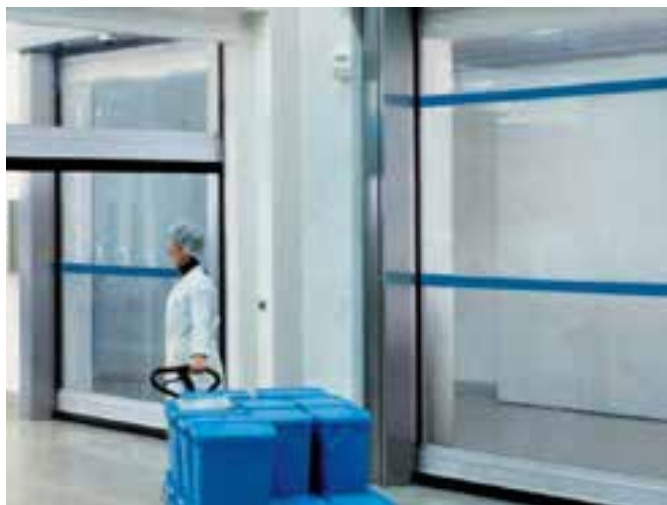
Food processing - cold and freezer

Comech Engineering specialises in highly demanding working environments such as medical, pharmaceutical, food industry and low temperature. Hermetically sealed, clean-room and cold storage are some of the many quality door products that can be installed to meet the highest specifications for specialist applications. Our many specialist doors provide guaranteed performance.