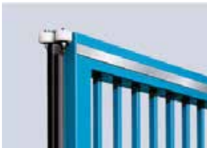
Additional aluminium guide rollers