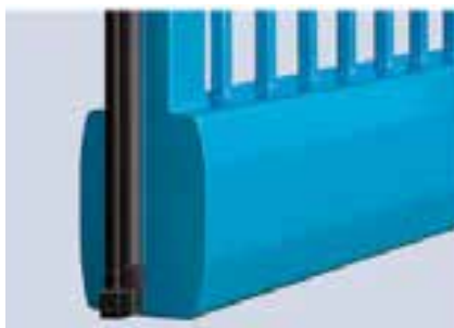
Safe automatic control